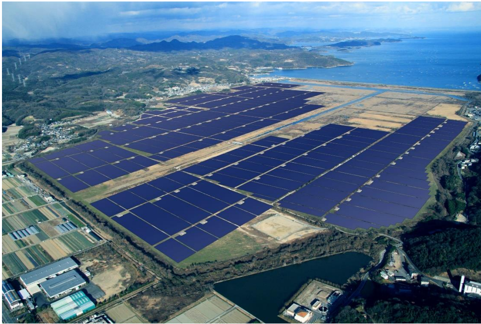
Conceptional drawing of Setouchi Kirei Mega Solar Power Plant